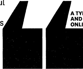
A TYPICAL EXCHANGE BETWEEN A MILLENNIAL AND HIS TEAM MEMBERS USING AN ANONYMOUS ONLINE FEEDBACK TOOL:

the responses into a performance dashboard, so employees can track their own private trend lines on skills they are working to improve.